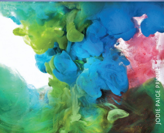
JODIE PAIGE PRINCE