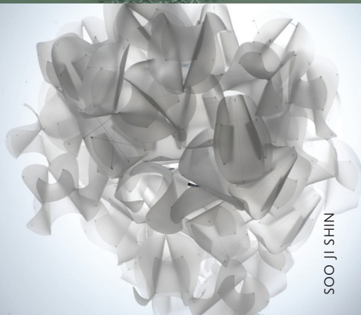
SOO JI SHIN